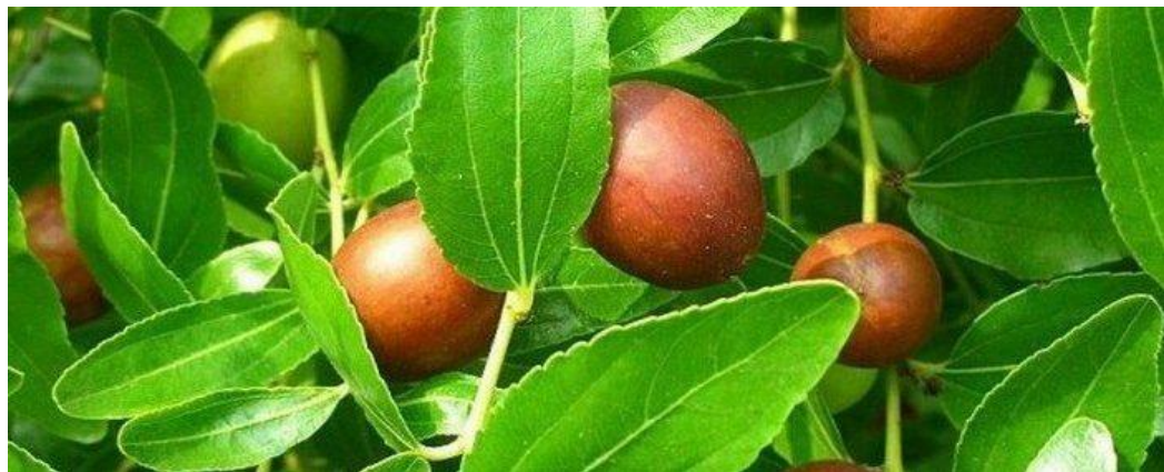
Figure 2.1: Description of Ziziphus spina